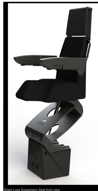
Shark Luxe Suspension Seat front view

The details of all vessels are offered in good faith but we cannot guarantee or warrant the accuracy of this information nor warrant the condition of the vessel. Any buyer should instruct their agents, or their surveyors, to investigate such details as the buyer desires validated. This vessel is offered subject to sale, price change, location or withdrawal without notice.