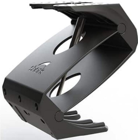
Shark Flex Suspension Seat front view