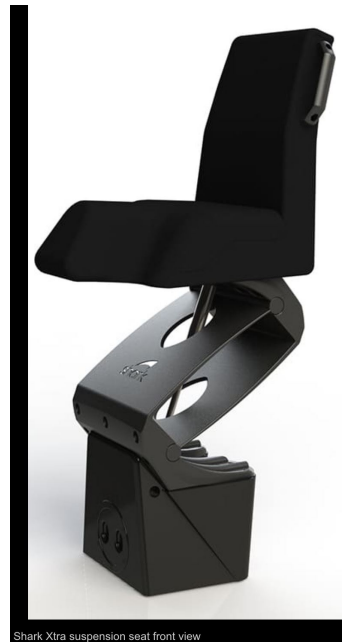
Shark Xtra suspension seat front view