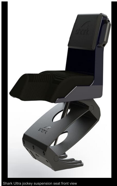
Shark Ultra jockey suspension seat front view