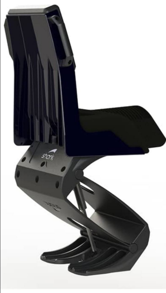
Shark Ultra suspension seat rear view