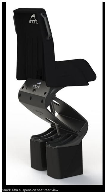
Shark Xtra suspension seat rear view