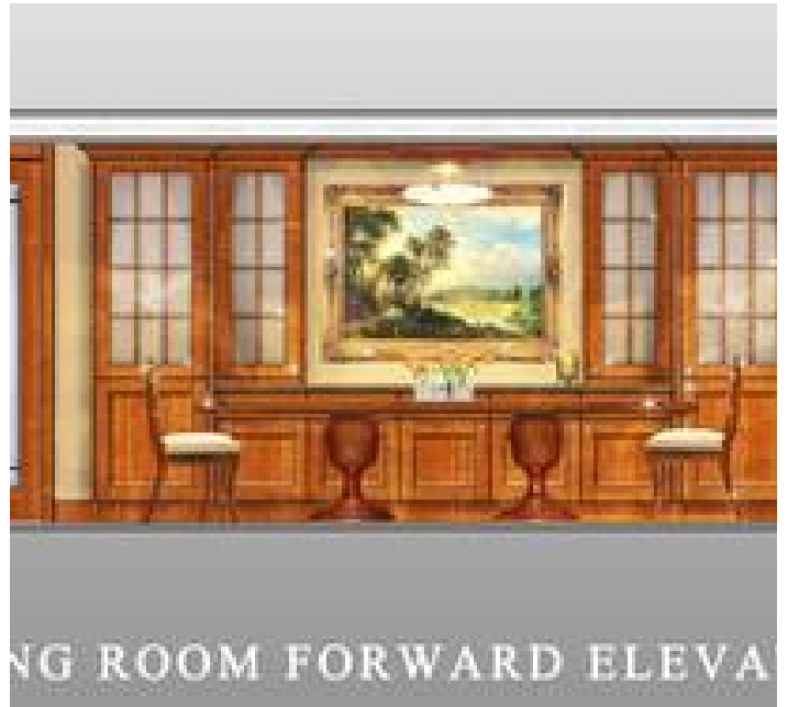
DINING ROOM FORWARD ELEVATION