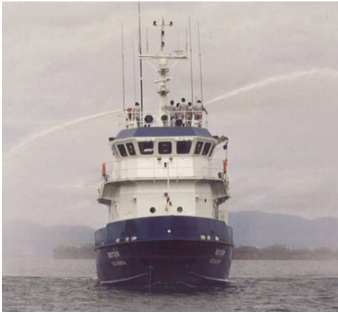
MULTI PURPOSE VESSEL