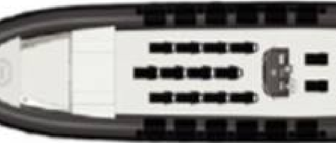
le console with 14 x One person | console with 14 x One person jockey