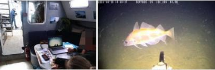
Mission scientifique ROV (Remote Operated Vehicle) au large de Groix